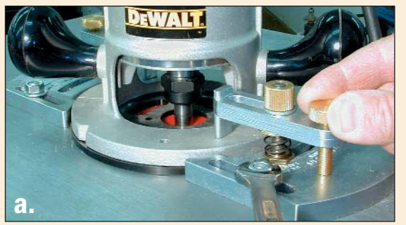
A unique, quick-clamp mechanism on the Veritas router table lets you mount or remove the router in seconds.

Veritas router table. Underneath the table is a unique clamping mechanism that lets you mount the router (or remove it from the table) in a matter of seconds ( Photo a. below). And don't worry if you have a router with an irregular-shaped base. This quick-change clamp can be adjusted to fit any router base.