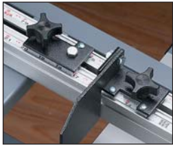
▲ Dual scales and dual stop blocks make the Rousseau easily adaptable to a wide range of board lengths.

The Rousseau HD, with an optional support wing and stop system, is an all-inclusive stand that's definitely at home in a shop. But on a job site it becomes a bit much to move because of its massive size and elaborate set-up and knockdown procedures.