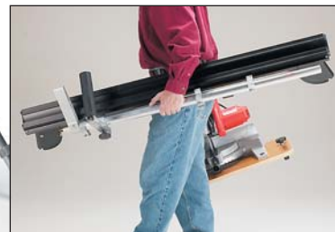
◀ With the legs folded under and the saw removed, the TracMaster is compact and lightweight. It sets back up in just a few seconds.