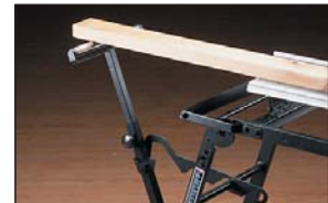
▲ Roller supports adjust rapidly to hold all lengths of board.

D elta's miter saw stand strikes an excellent balance between being loaded with features and still being collapsible and portable.