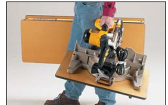
▲ Easy to carry, hard to set up, and expensive. Not the best choice.

Considering the price tag on this stand ($205), it's hard to recommend it.