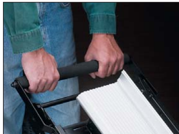
▲ A cushioned hand grip takes the pain out of moving this stand around the job site.