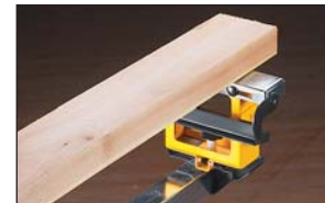
▲ The stock supports double as stop blocks on the DeWalt.

H ere's a good miter saw stand for a busy DIY'er. Don't have time for assembly? There's very little required with the DeWalt miter saw stand. Plan on moving around your job site quite a bit? This 35-lb. unit is an easy one-handed carry thanks to the built-in handle. And when the work is done, remove the saw from the stand with the quick-release levers, fold the legs up under the stand, and you're ready to go.