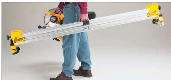
▲ The DeWalt's lightweight construction and built-in handle leave one hand free for carrying the miter saw as you move from place to place.

The stand is competitively priced at around $230. And despite having fewer features than other stands in this price range, it's a good investment for the DIY'er on the move.