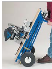
◀ A simple and compact design may not be enough to justify the high price of the Trojan.

Strangely enough, they've priced this unit as though it were overflowing with extras ($360). So, in a nutshell, you have to pay more and get less if this is your choice.