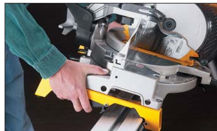
▲ The saw mounts have quick-release levers for rapidly repositioning the saw on the beam.