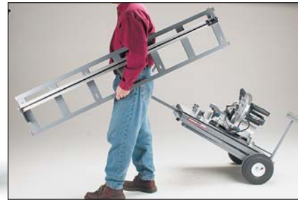
◀ The basic stand folds down, with the saw mounted, into a mobile cart. The support and stop options are a bit of a burden to move.