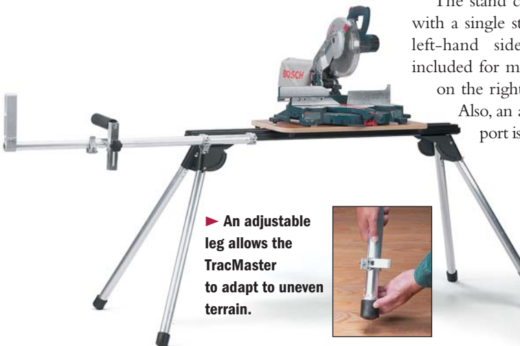
► An adjustable leg allows the TracMaster to adapt to uneven terrain.

In general, this stand is light on features but heavy on convenience and portability. The price is a bit high (around $250), considering other, similarly priced stands have more features. But it's still a decent stand that will earn its keep.