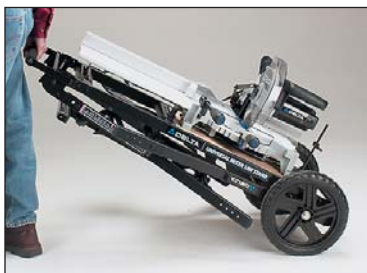
▲ It's hard to believe that all the features on the Delta stand can be condensed into such a small package.

As long as you've got the patience to assemble it and learn its mannerisms, you'll have a miter saw stand adaptable to any project you take on.