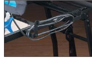
▲ Cord wrap stores cord neatly and releases it instantly.