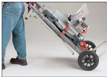
▲ This stand moves easily and unfolds quickly into a sturdy unit with up to 8 feet of stock support.