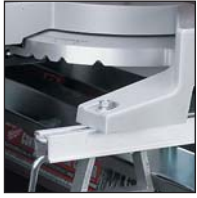
▲ Hand cranks lock and unlock the saw for relocation or removal.

There are three words to describe Milwaukee's Heavy-Duty Work Center — simple, rugged, affordable. It's a good combination for anyone who just wants to get some work done without being bothered by a lot of setup.