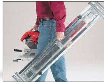
◀ Although the Milwaukee is compact when folded, it's quite heavy. You may want to make a second trip to get the miter saw.