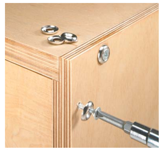
▲ Trim Washer. Trim washers are a great way to strengthen an assembly, especially near the edge where you may not want to countersink the screw.

And finally, trim washers can prevent "overdriving" the screw. Which can be a problem in softer materials.