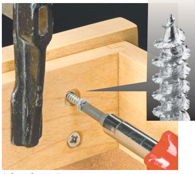
▲ Spax Screw. The unidrive head allows the screw to be driven with Phillips, Pozidrive or Robertson (square-drive) drivers. Serrated threads at the tip of the screw make them self-tapping and easy to drive.

need to join cabinet pieces or wood components, we reach for Spax screws. As you can see in the photo inset below, one of the unique features of the Spax screw is the serrated threads at the tip. The serrated portion of the screw is slightly wider than the remaining threads. So the serrated tip cuts a pilot hole and the rest of the threads follow with minimal friction.